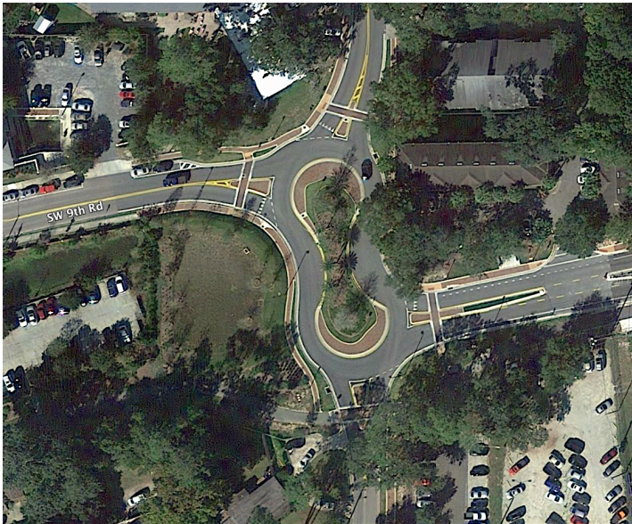
Rectangular roundabout in Cape Coral and a peanut roundabout in Gainesville