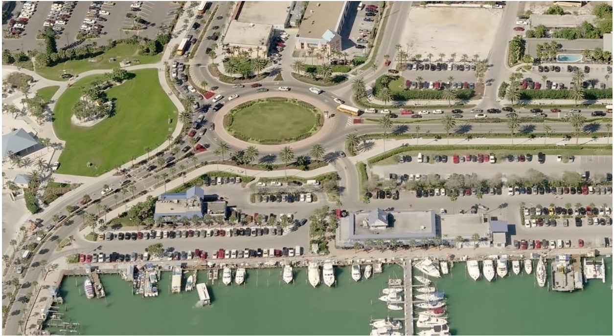
Clearwater Beach, Opened December 1999. Up to 58,00 entering vehicles per day.