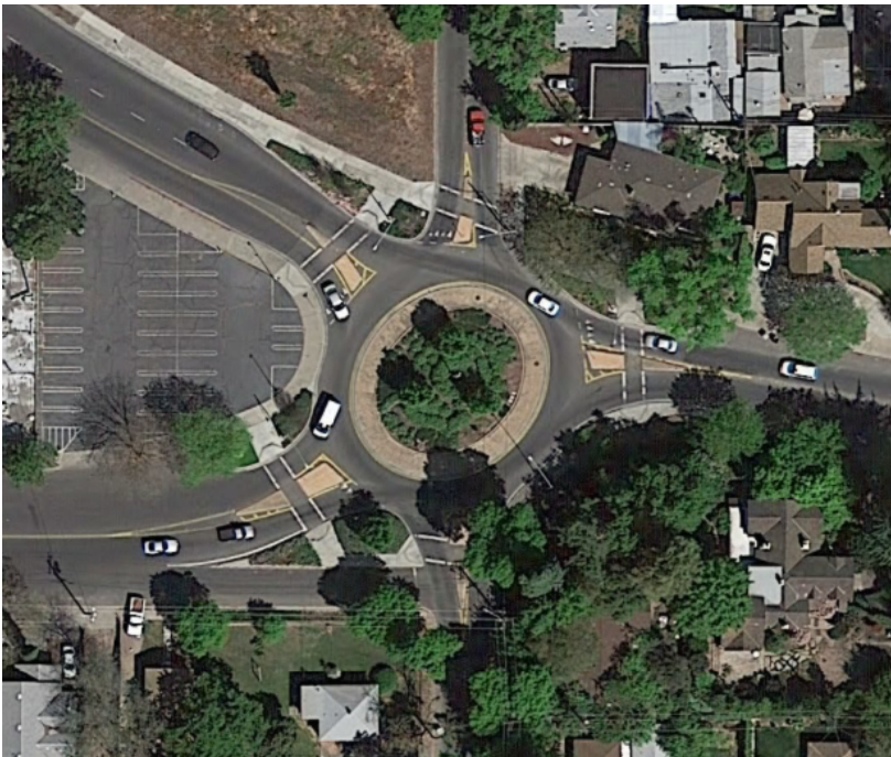
Modesto California, G Street, opened around 1998.