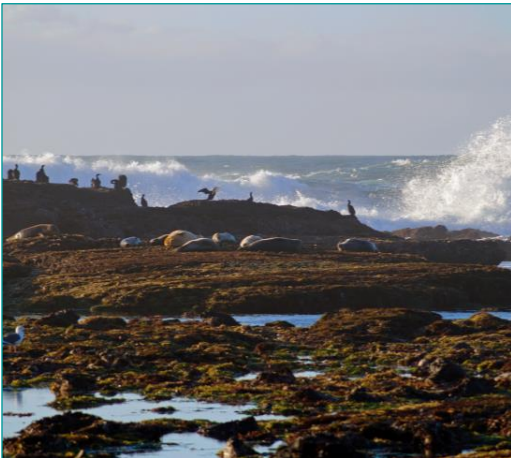
Seal haul-out areas at the reserve.