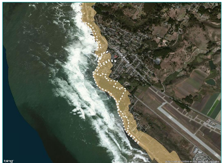
Erosion Extent: Reserve is and will be exposed to coastal erosion.

The entire western boundary of the Reserve is located within the area identified by the Pacific Institute study (2012) as potentially exposed to erosion. The yellow band represents the eastern extent of erosion that can be expected by 2100. See the "Exposure Discussion" section for more details pertaining to the effects of coastal erosion on this asset.