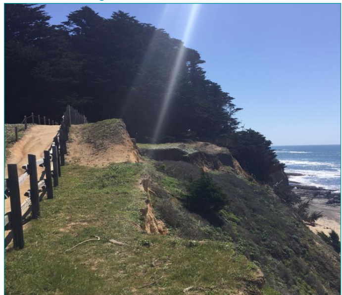
Bluff habitat at Fitzgerald Marine Reserve.

This is the only Asset Vulnerability Profile on vulnerable rocky intertidal areas in the County. At the time of this assessment, an exhaustive dataset of Rocky Intertidal Areas in San Mateo County is unavailable.