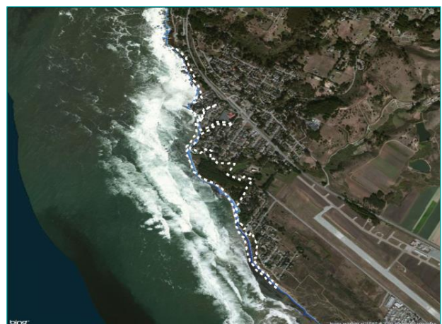
High-End Scenario: Reduced beach and tide pool area.