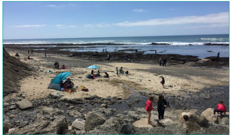
Fitzgerald Visitors use the tide pools and access the beach.

Saltwater intrusion at the San Vicente Creek could threaten the California red-legged frog habitat and breeding areas farther upstream. The restoration area is sensitive to flooding and a portion was damaged by the king tides in 2016. Educational uses of the site are moderately sensitive to sea level rise impacts; the presence of tide pools, seal haul-outs, beach access, and protected species influence the visitation rates. Built structures on site, including a ramp access, are sensitive to flooding as they were damaged during recent storms (2016), making them unusable until they could be repaired.