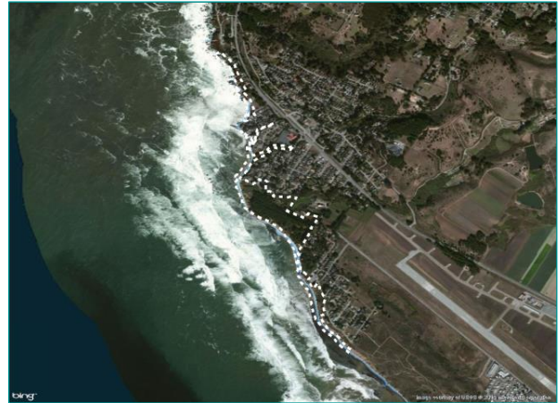
Baseline Scenario: Beach and tide pool inundation.